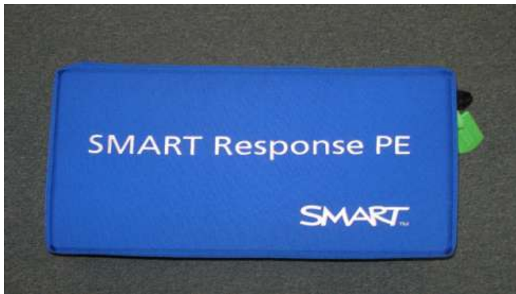
SMART Response System- PE