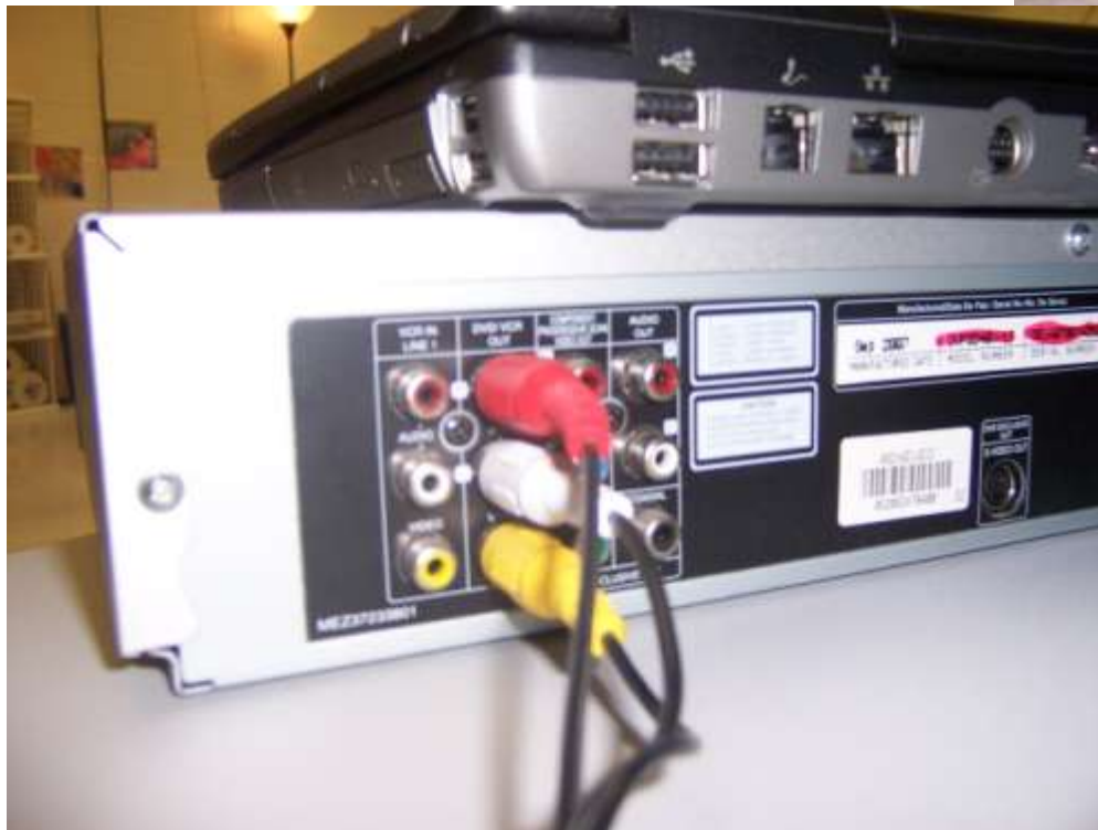
Connection point on back of DVD player